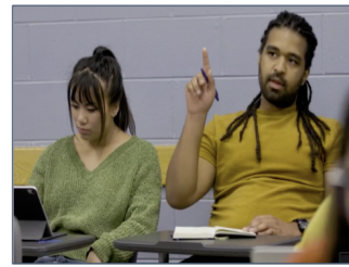
University of Michigan's Center for Research on Learning and Teaching Players from the skit Conflict in the Classroom . Students respond to a heated moment that arises during a review of their problem sets.

Deliberate interactions centered around identity, power, privilege and positionality